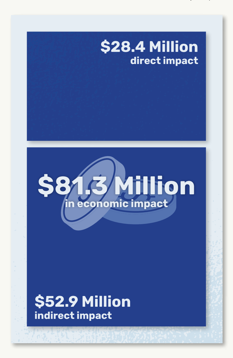
Table 7: Direct and Indirect Employment Driven by the Presence of the Pitt-Bradford, 2021

The overall economic impact of the Pitt-Bradford operations on Pennsylvania in FY '21 was $81.3 million ($28.4 million direct impact and $52.9 million indirect and induced impact).